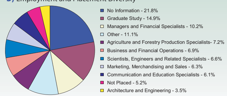
Figure 3. Agriculture and Related Sciences, Undergraduate and Graduate Student Job Placement, 2006